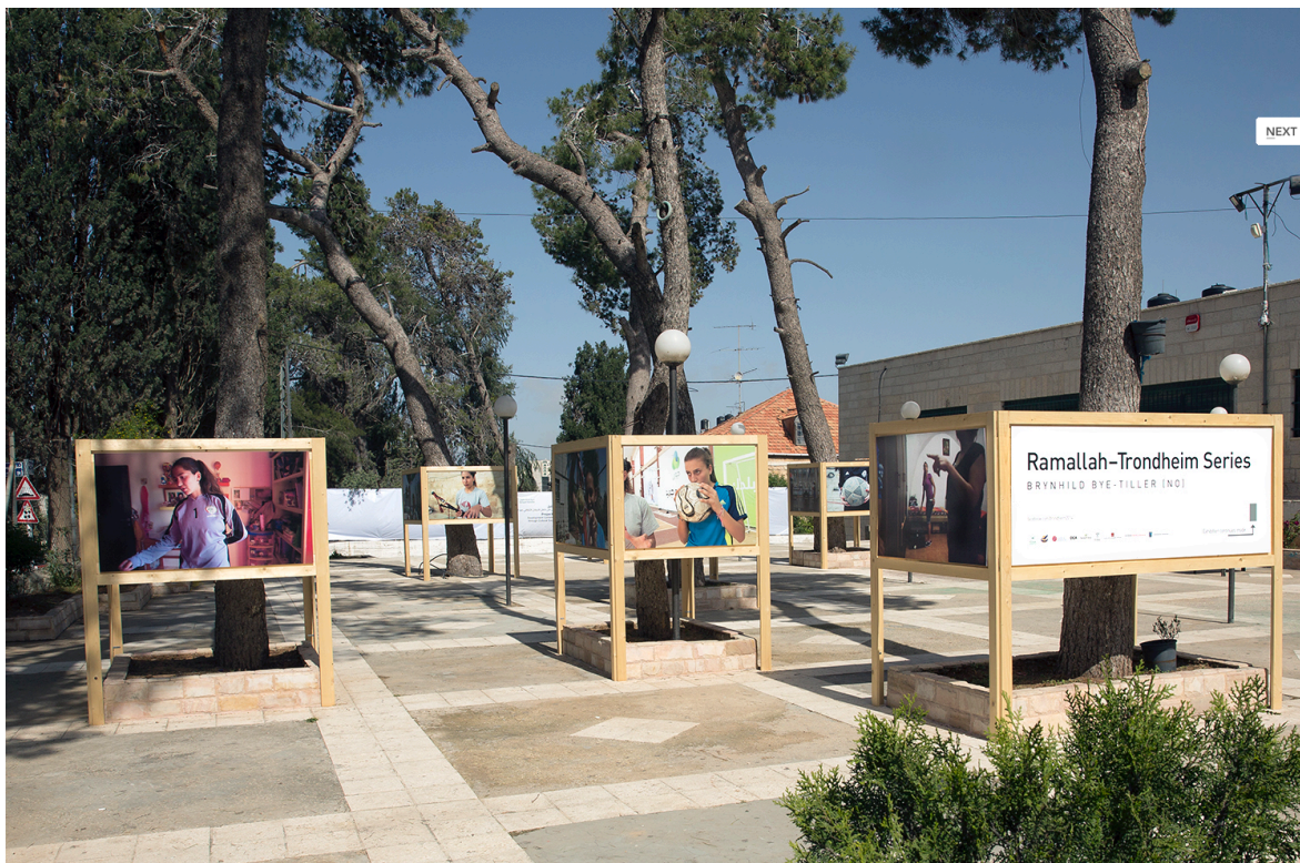
Exhibition Al-Tireh street, Ramallah, Occupied West Bank, Palestine. April-May 2015 at the premises managed by the project's main partner Sareyyet Ramallah.

In the first exhibition in 2015 there was a large amount of smaller images, Facebook-prints and 28 large color images ( picture ) presented outdoor of both Palestinian and Norwegian players side by side. This combination also provided a discussion about distance, empathy and cultural differences. In the second exhibition (sept. 2017) in Trondheim, will another geographical site further elucidate these combinations and provide an additional input and new opinions.