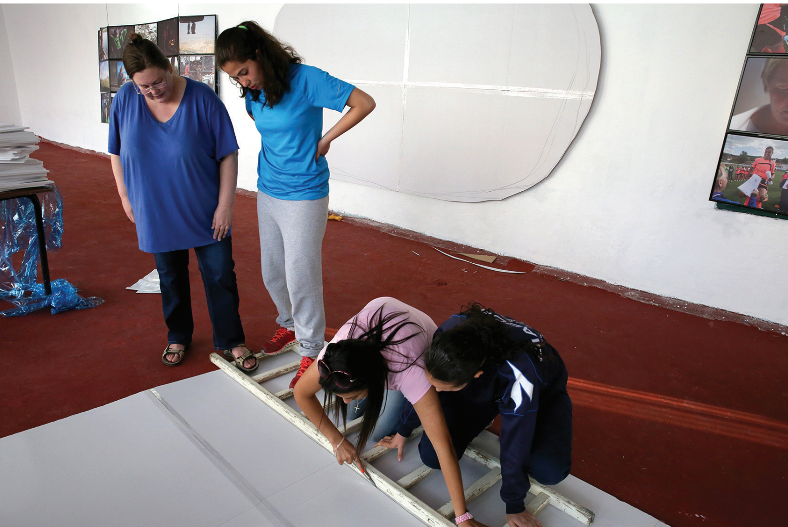
The artist and the players (Art Crew 1) are setting up the final exhibition, measuring and marking the distance between the images before putting them up on the wall. Ramallah, West Bank, Palestine. April 2015.