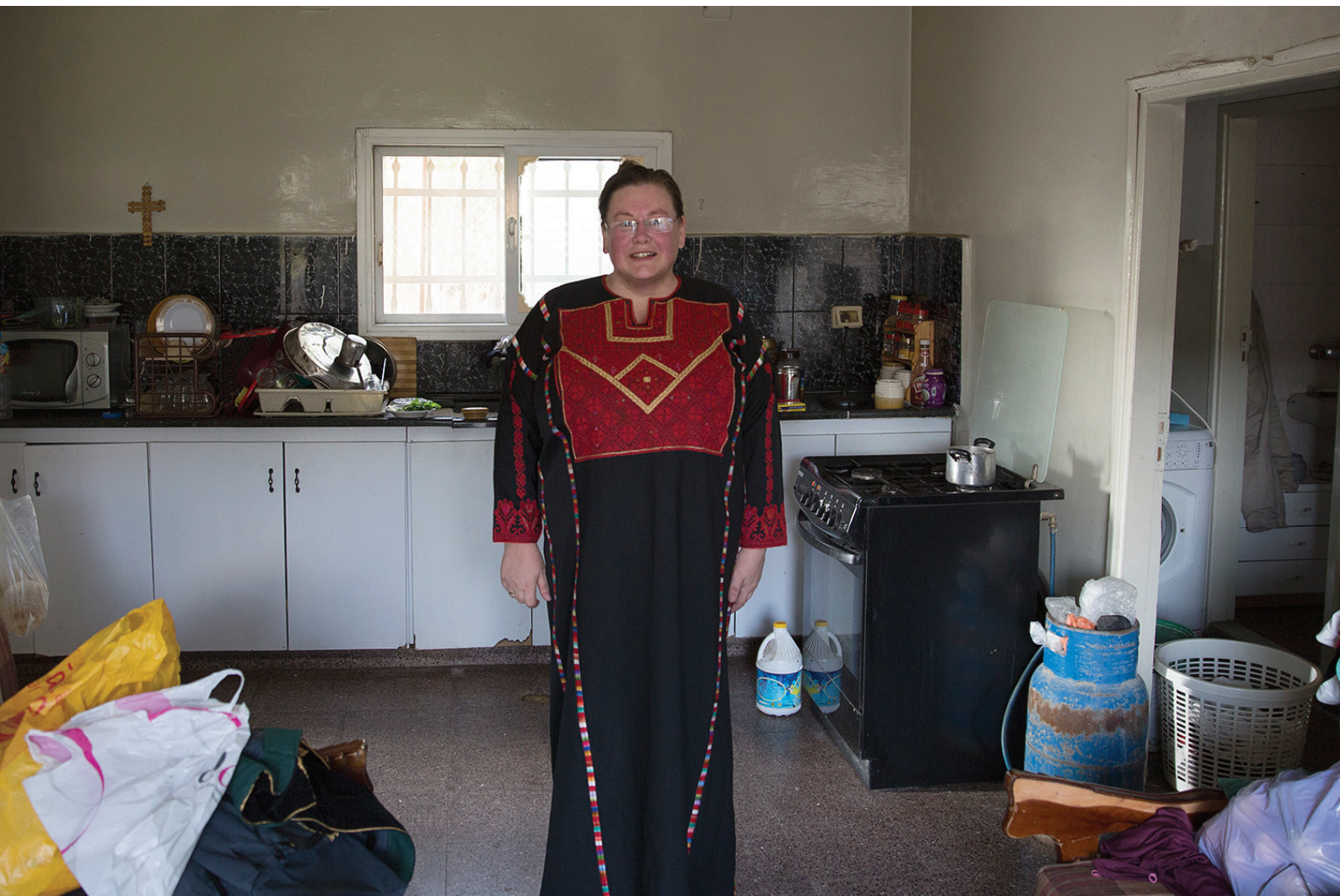
Home visit in Ein Arik, a palestinian village outside Ramallah in the West Bank. Above the artist in a traditional Palestinian clothing for a village woman.