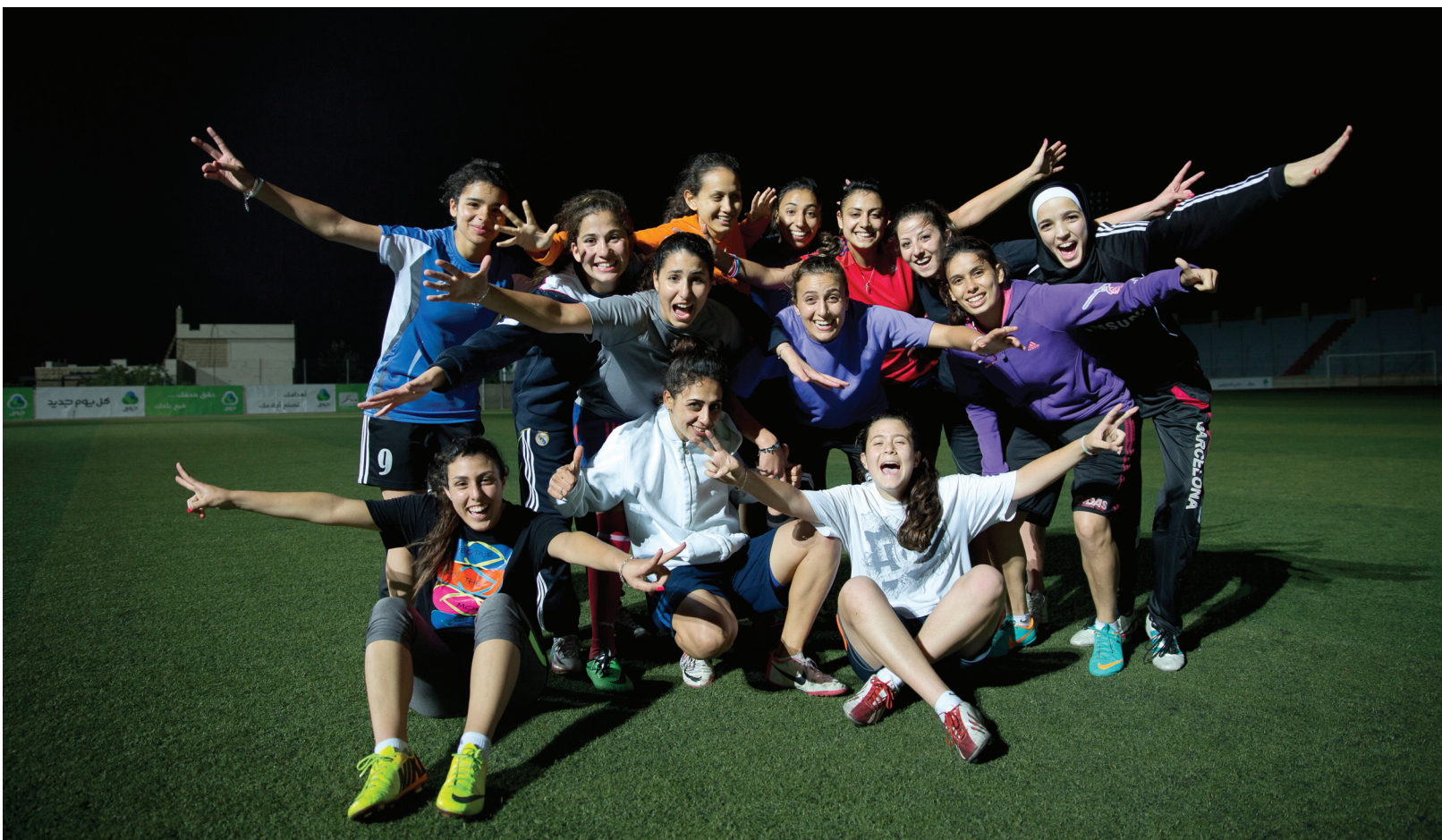
3 times Palestinian Champions, Sareyyet Ramallah plays against Trondheim