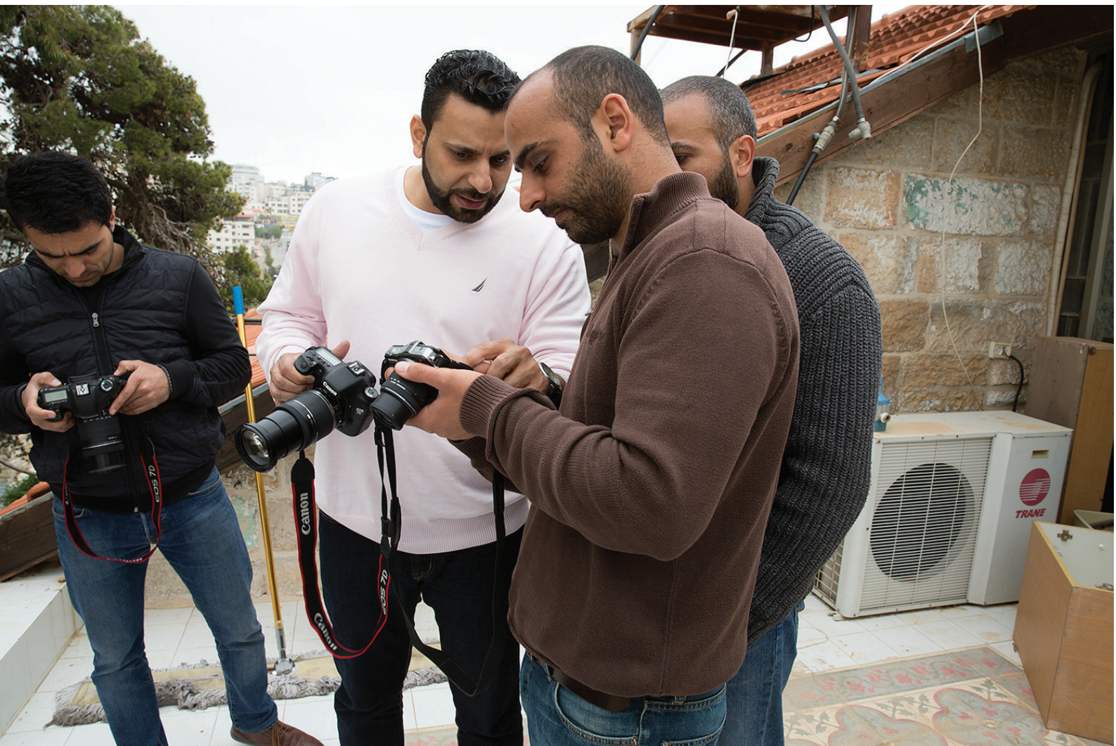
Participants discussing camera settings at the photo workshop in Ramallah, West Bank, Palestine. April 2015.