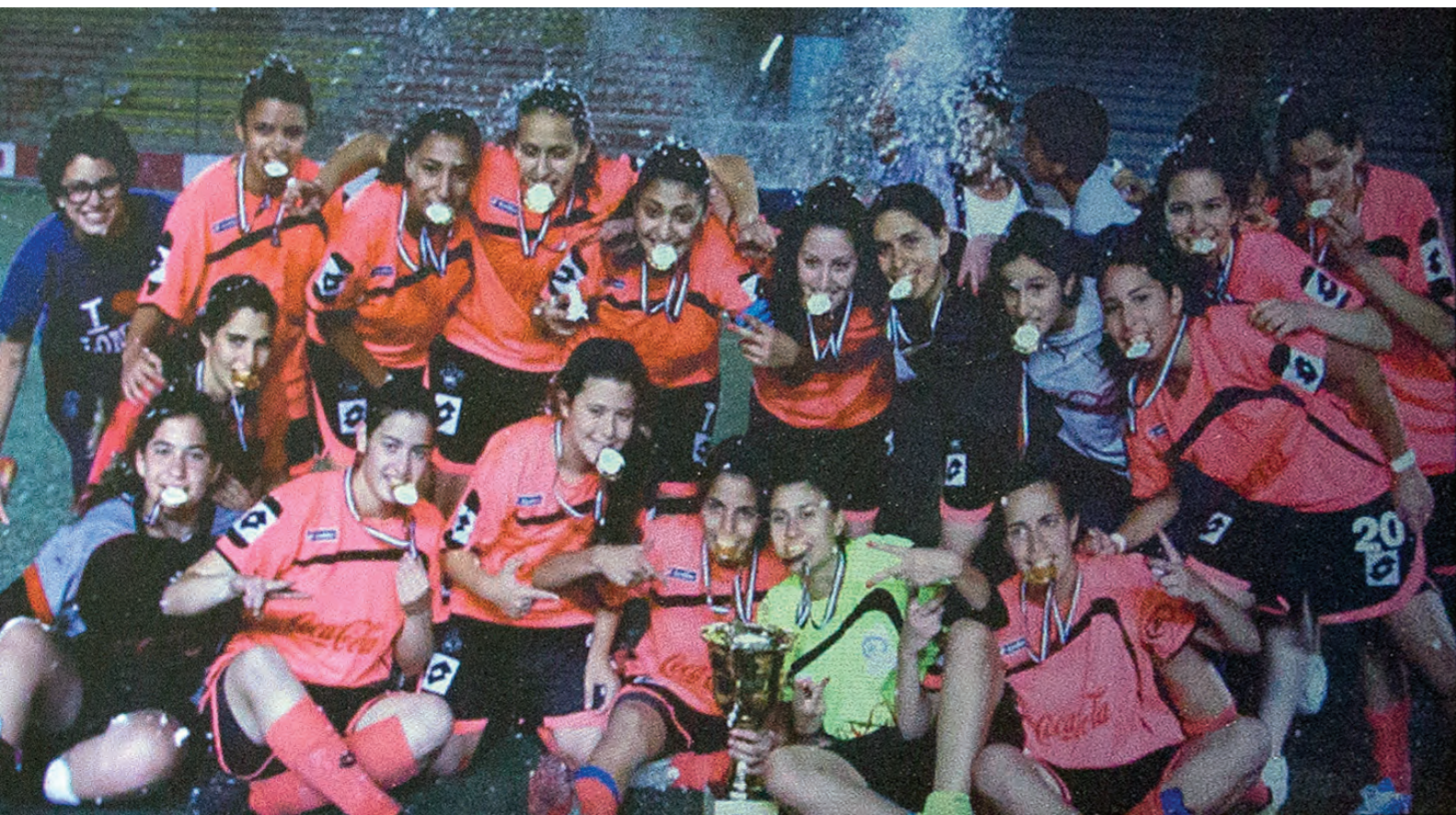
Sareyyet Ramallah, palestinske mestre i fotball.