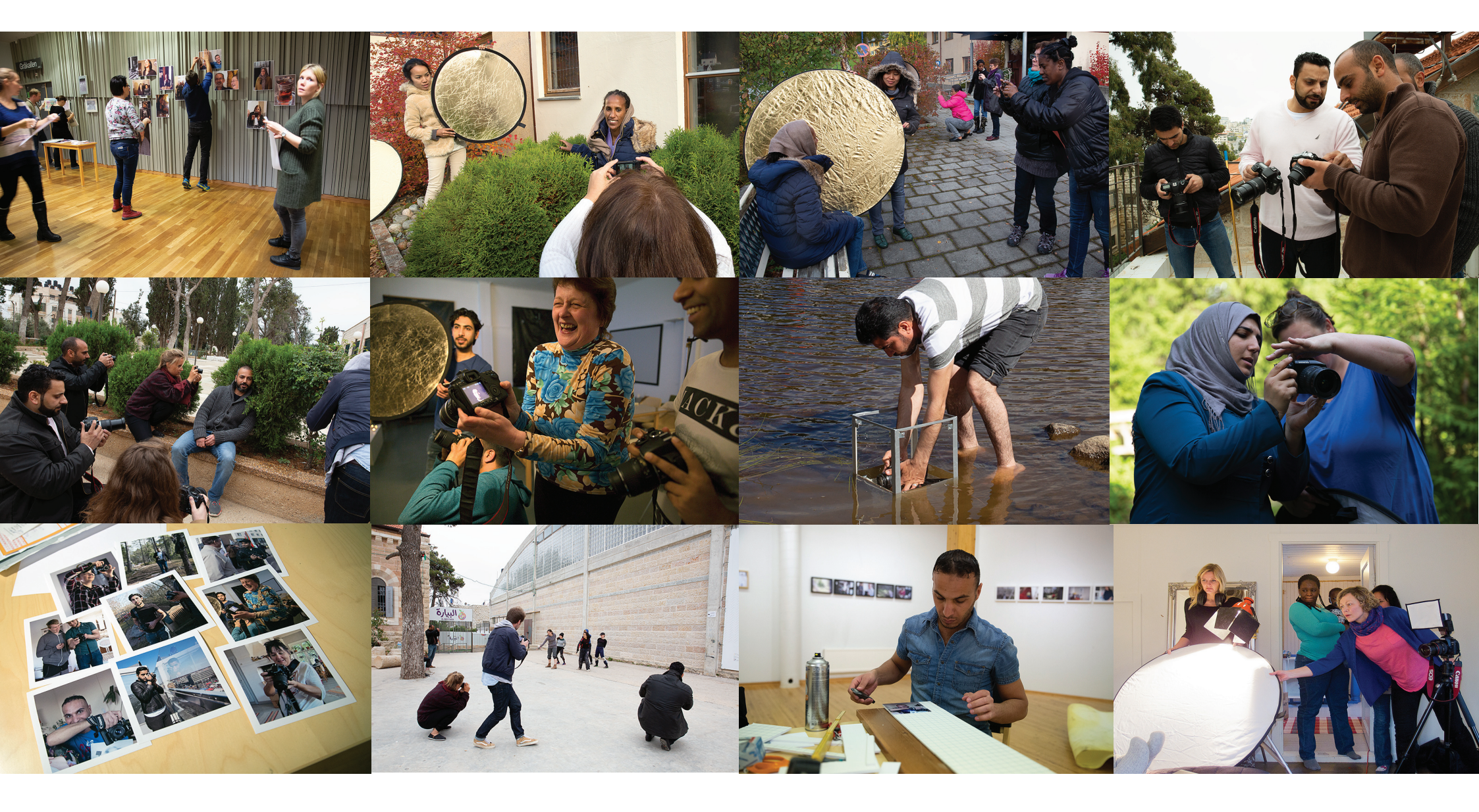
PHOTO WORKSHOP AS A METHOD: From photo workshops in Norway, Europe and Middle East. Participants are refugees, asylum seekers, immigrants, students, photographers and artists.