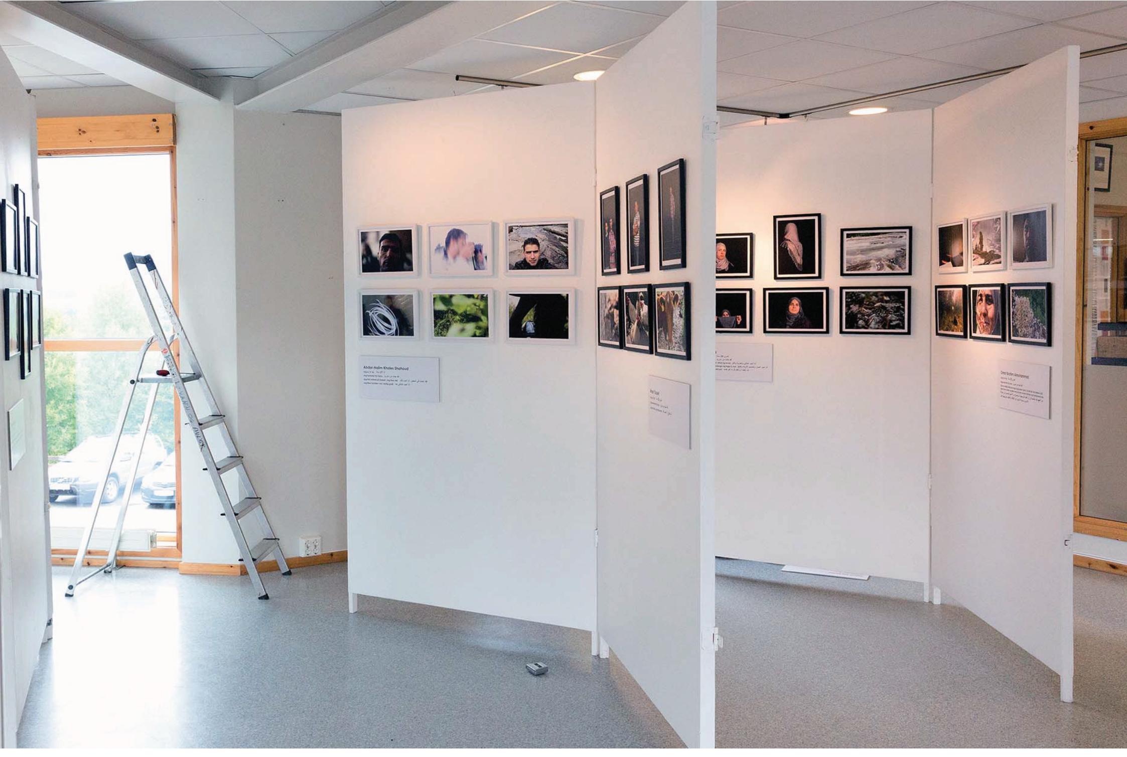
PHOTO WORKSHOP AS A METHOD: An exhibition after a ten-day photo workshop for refugees and asylum seekers arranged by Namdalseid municipality in the summer of 2017.